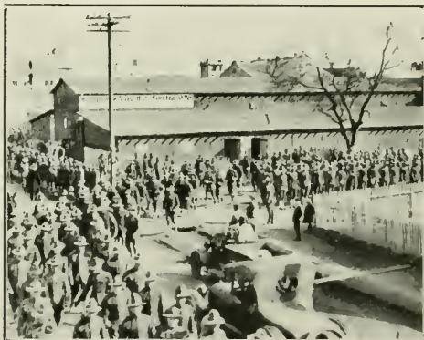
CHURCH HEADQUARTERS, CAMP UPTON, YAPHANK, L. I.